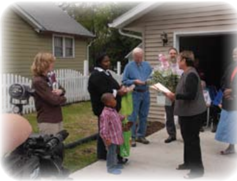
CFNIL gives flowers to homeowner.