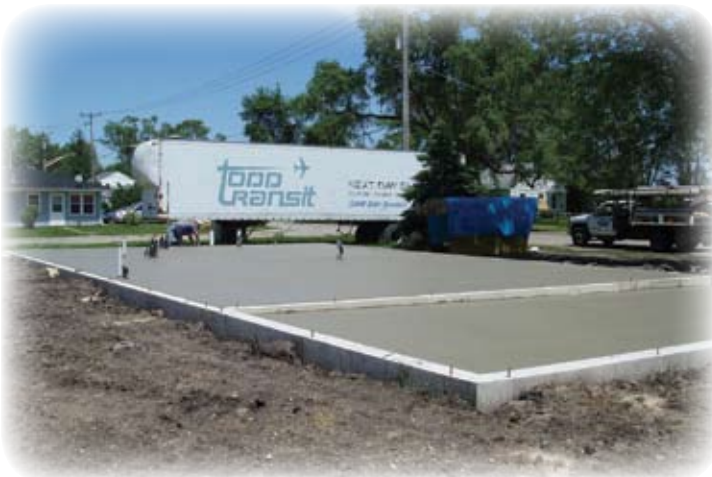
So this is how it starts