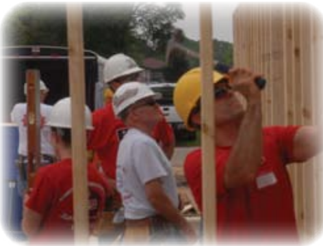
Blitz Build—Rockford firefighters give a hand.