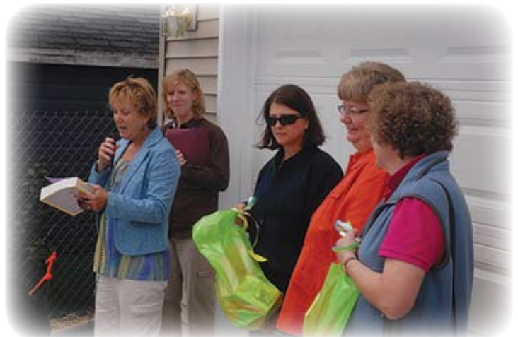
Dedication—Northern Illinois Reading Council donates books