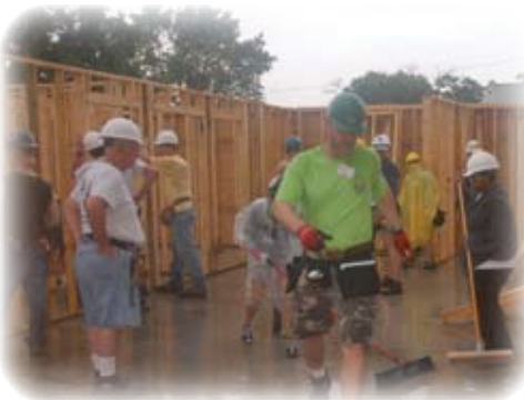
Blitz Build—volunteers work after the rain.