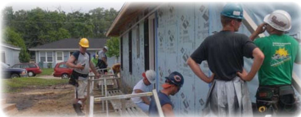
Blitz Build—Builder with a duct tape kilt?