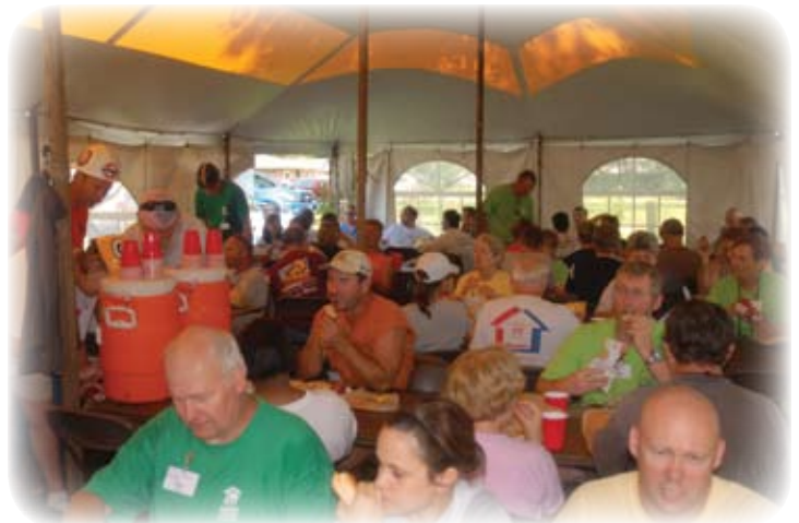
Blitz Build—lunch time for hard working volunteers