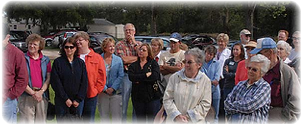
Habitat 2009 Dedication Attendees

All new homebuyers had an opportunity to thank volunteers and donors for their support of our program. Their homes were blessed as was the bible they received from our board of directors.