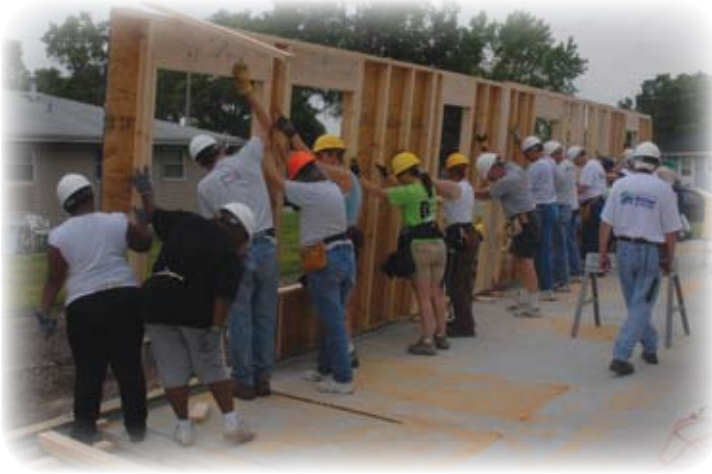
Blitz Build—future homeowner helps frame house