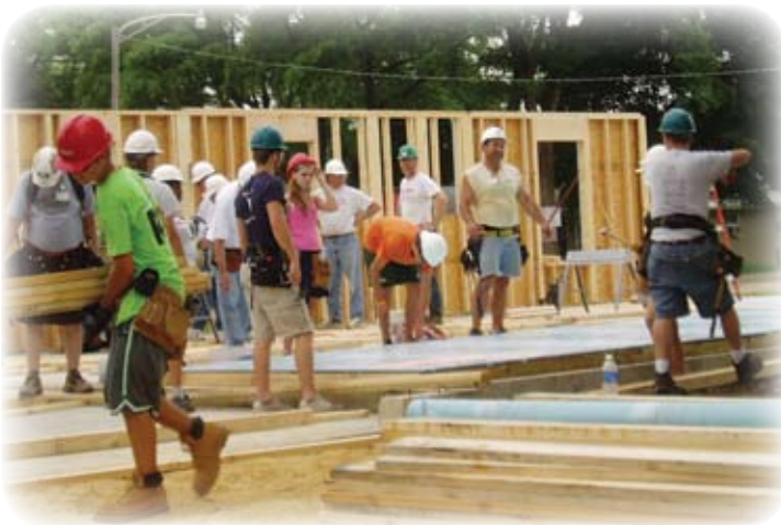
Walls going up